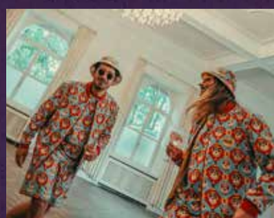
DICHT UND ERGREIFEND // GER