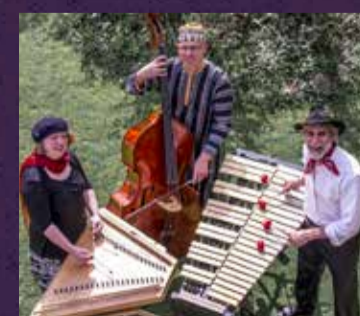
TRIO RÄSS // SUI

Further details, including the announcement of the winner of the German World Music Prize RUTH, and the complete programme, will be published in mid-April 2024. Accreditation will open at the same time online and at our press office.