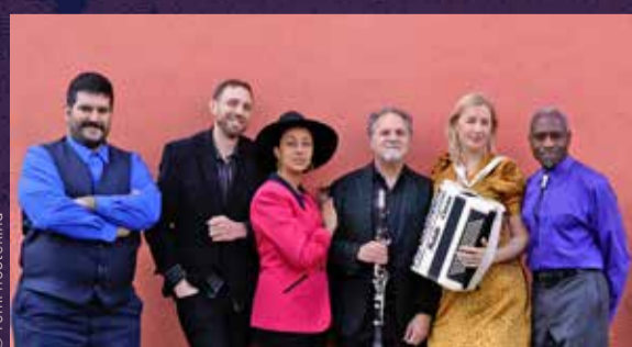
KRAKAUER & TAGG' MAZEL TOV COCKTAIL PARTY // USA